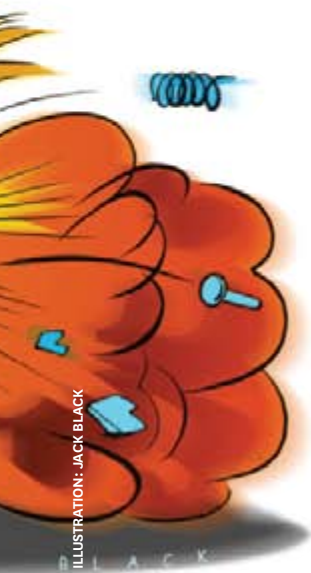
ILLUSTRATION: JACK BLACK

The successful season caused the team members to believe Ducati could win it all in 2004. After all, if they could finish second as rookies, why shouldn't they take first now that they had some experience?